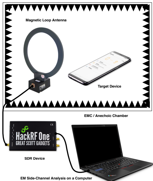
Figure 3: An illustration of how an EM side-channel analysis would be performed in a forensic investigative setting. Target device is placed inside an EMC/Anechoic chamber and observed using an SDR device that is connected to an EM analysis software framework.

already starting to be realised and others are ambitious predictions that can prove significantly beneficial.