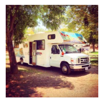
Fig. 7: Original Image

In the future, SSERT can be expanded to perform similar analysis and evidence recovery from additional synchronisation services, such as OnionShare. Combining polling and the analysis of the information available from the remote