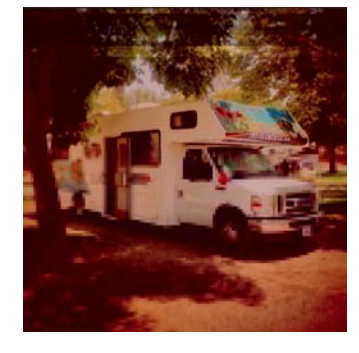
Fig. 8: Partial Retrieval